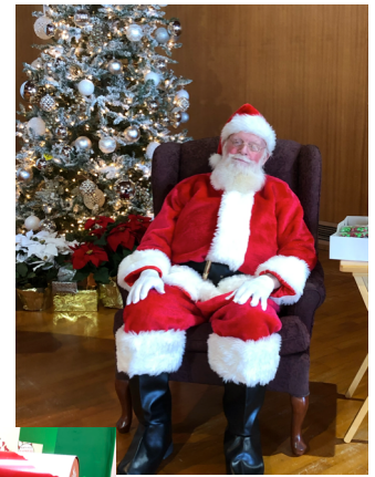
A Visit With Santa Dec. 7

On Dec. 14 Face Autism was invited to visit with Santa. About 45 children attended with parents, siblings, and grandparents. At this event even an ice cream truck provided sweet treats for all to enjoy. There was also a hot chocolate bar, crafts and cookie decorating. Even Santa enjoyed visiting with all the children/pets.